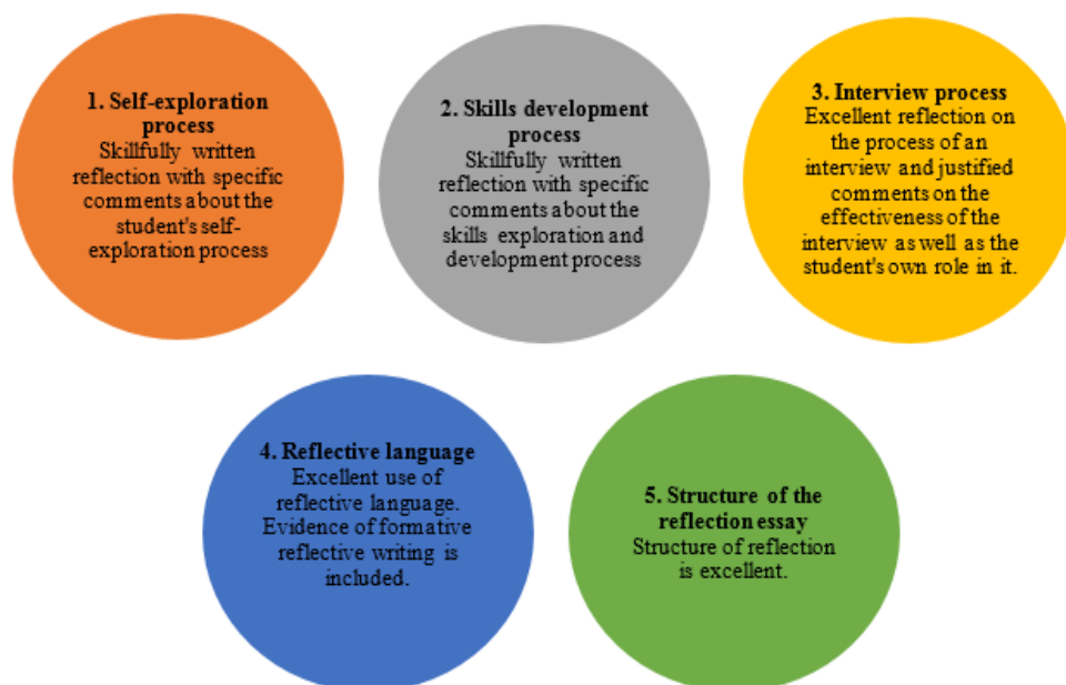
Figure 1. Five criteria from the university assessment criteria in the module DPI for the reflection essay

the reflection essay were written on the board and coded with one colour (see Figure 1).